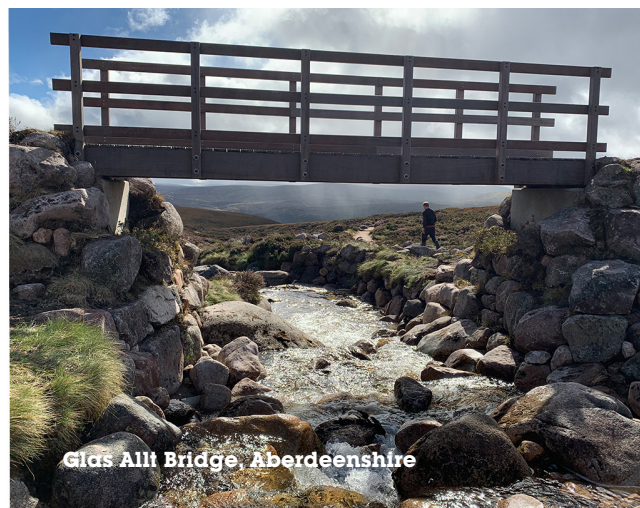
Glas Allt Bridge, Aberdeenshire