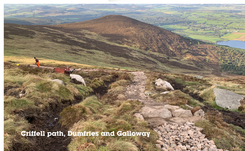
Criffell path, Dumfries and Galloway