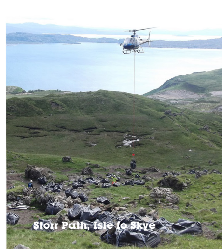
Storr Path, Isle of Skye