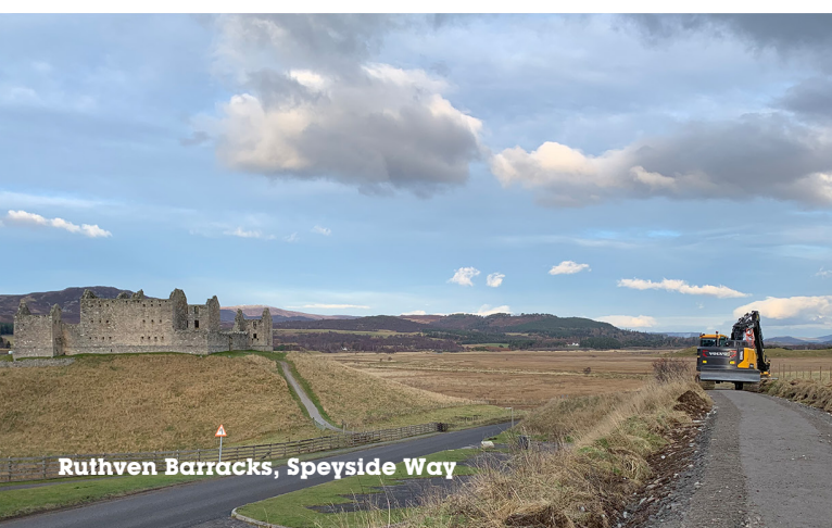
Ruthven Barracks, Speyside Way