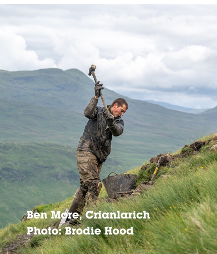
Ben More, Crianlarich

Much of the path had been built in the early 90s and had been maintained by Balmoral rangers, but heavier work was needed including resetting water-bars and cross-drains. Some light-touch work such as shifting rocks to make clear the path across a boulder field was also needed.